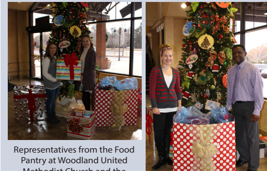
Representatives from the Food Pantry at Woodland United Methodist Church and the Central Alabama Veterans Health Care System were thankful for the Town's donations.