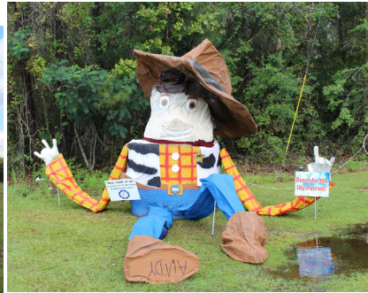
Bridlebrook Farms Neighborhood