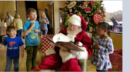
Santa surprised the youngest attendees of the Celebrate the Season event.

The Pike Road Arts Council invited everyone to Celebrate the Season on November 18. The event featured handmade gifts from Alabama crafters, Christmas trees decorated by local groups and artisans available by silent auction to benefit the Food Pantry at Woodland United Methodist Church, and a surprise visit from Santa Claus that brought excitement to all ages.