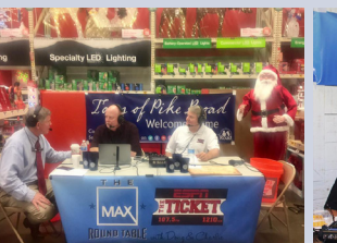
December's Monday with the Mayor was hosted at Home Depot on Chantilly Parkway.