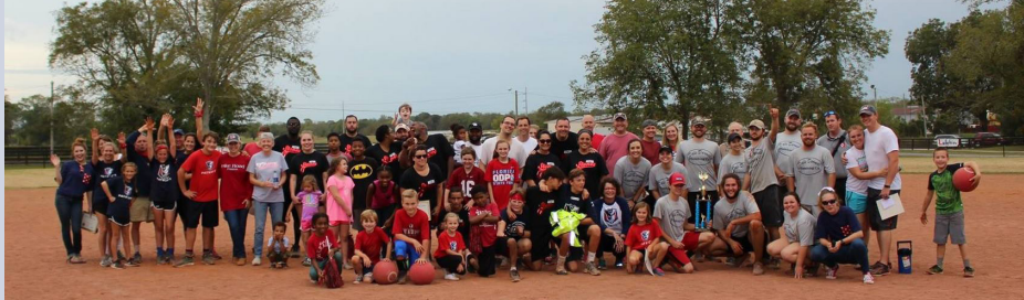
Players and Fans at the 2017 Founders Week Kickball Kickoff