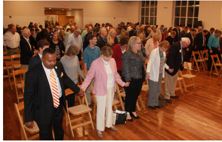
The community shares a quiet moment at the Historic Pike Road School dedication.