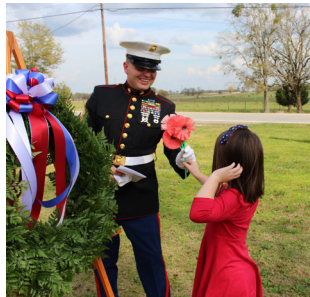
A Pike Road Schools learner shares a Remembrance Poppy with a Marine.