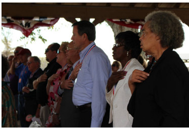
The Pike Road community honored our nation's veterans on Nov. 5, 2017.