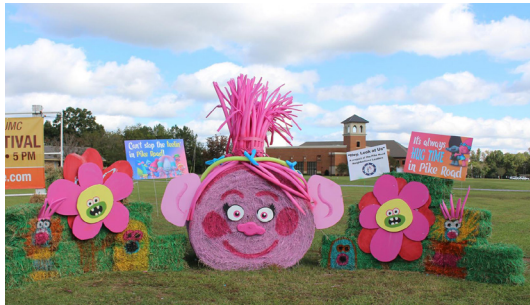
St. James United Methodist Church

People's Choice Award: Bridle Brook Farms